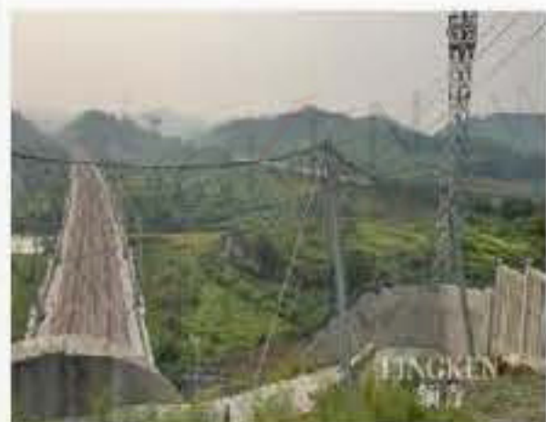
Rockfall protection wire rope 落石防护钢丝绳