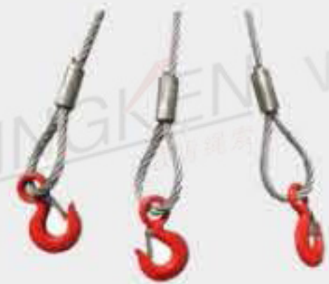
Wire Rope Rigging 钢丝绳索具