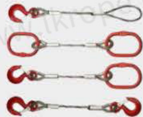
Wire Rope Rigging 钢丝绳成套索具