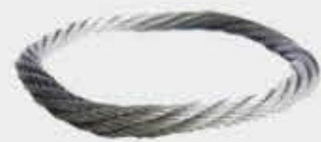
Jointless Wire Rope Sling 无接头钢丝绳吊索