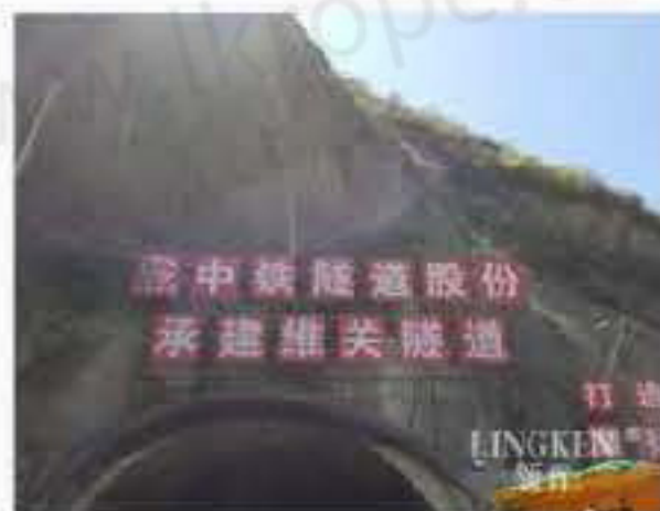
Passive Flexible Protection System 被动柔性防护系统