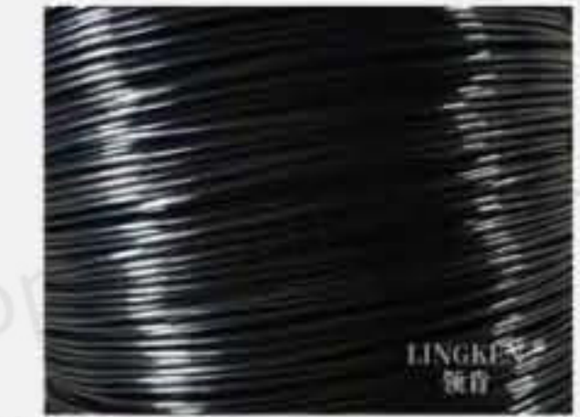
Oil quenched-tempered spring wire 油淬火-回火弹簧钢丝