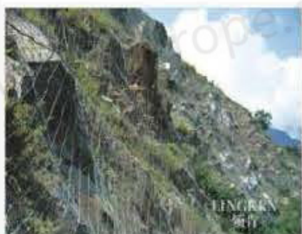
Diamond slope protection net 菱形边坡防护网