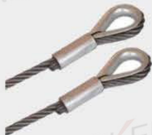
Pressed Wire Rope Rigging 压制钢丝绳索具