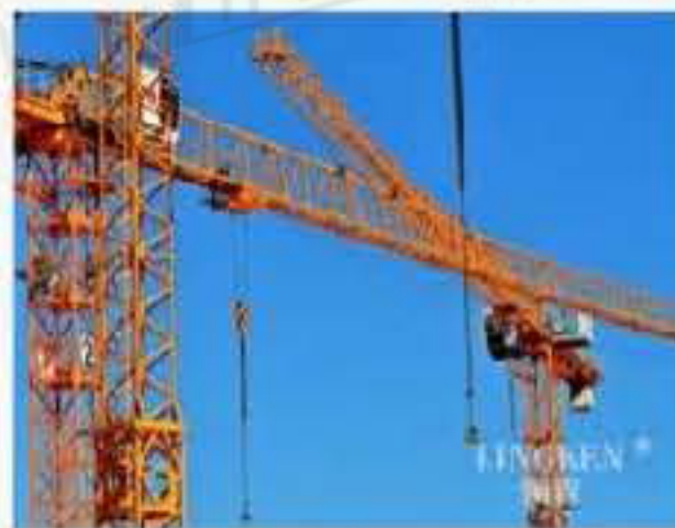
Wire rope for tower crane 塔式起重机用钢丝绳