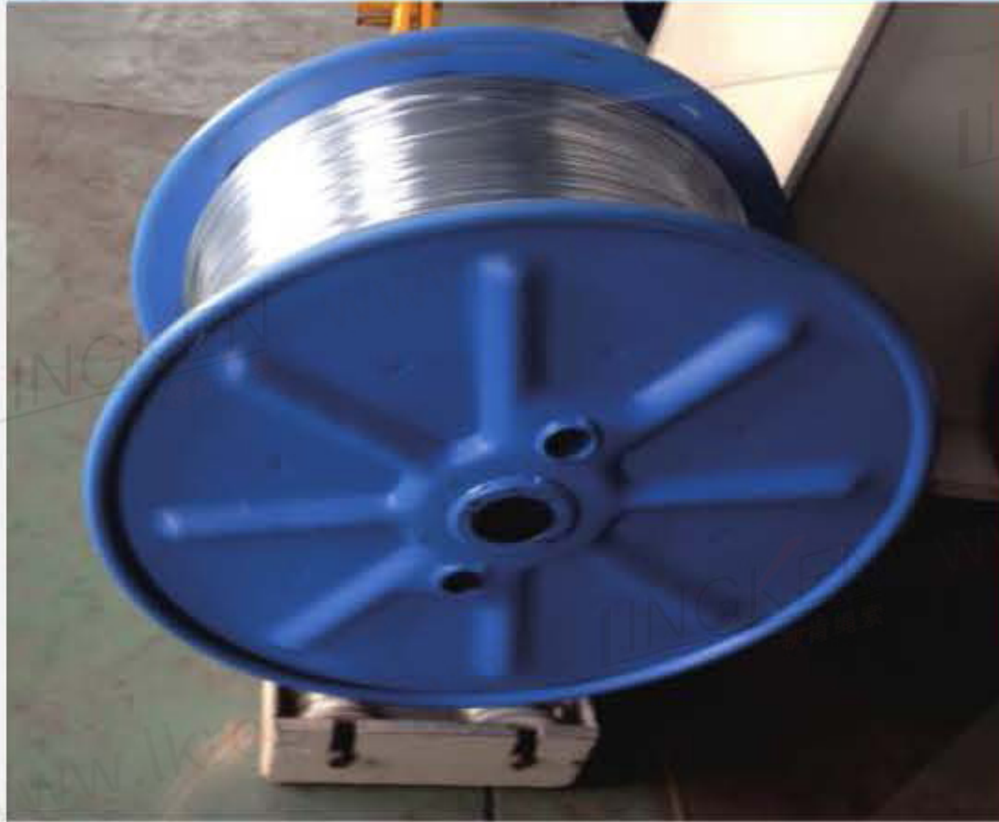
Iron Wheel 铁轮包装