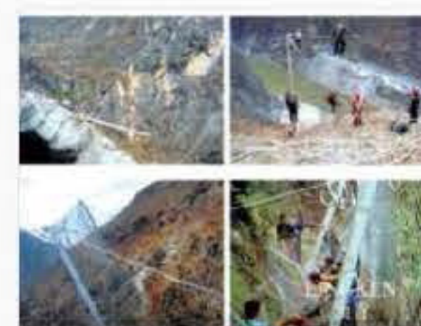
Passive Flexible Protection System 被动柔性防护系统