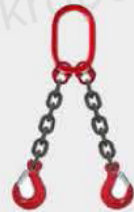
Wire Rope Rigging 钢丝绳索具