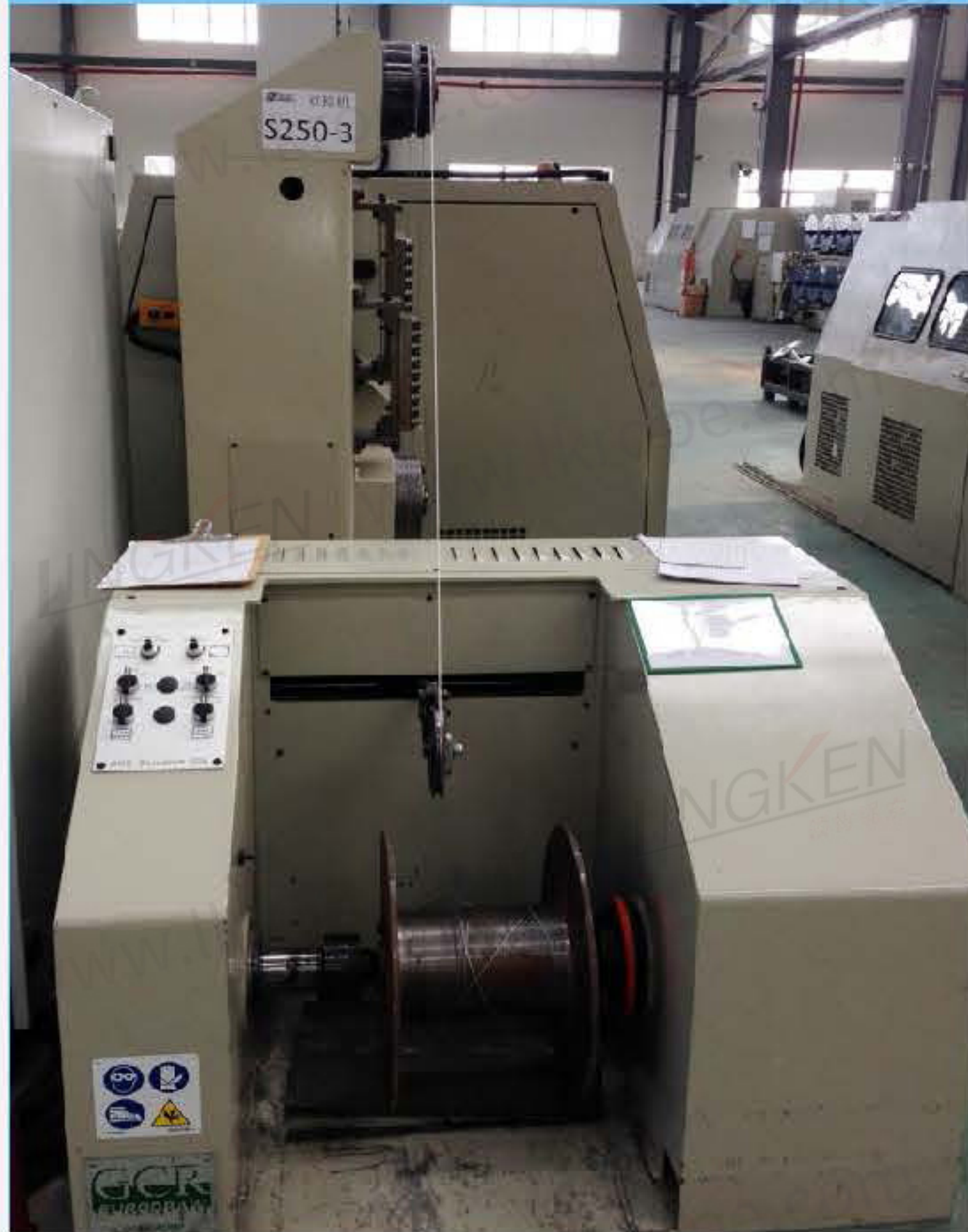
Double Stranding Machine 双捻股