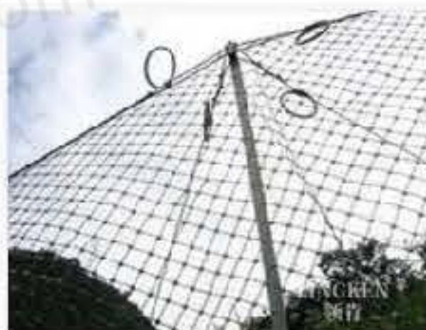
Passive Slope Protection Net 被动边坡防护网