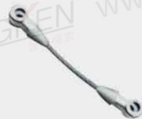
Open Cast Rigging 开式浇铸索具