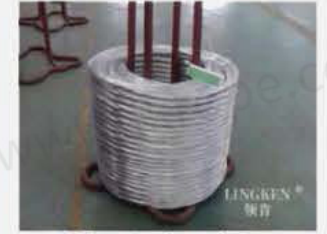
Galvanized steel wire 镀锌钢丝