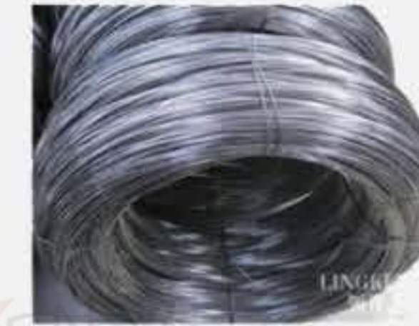
Carbon spring wire 碳素弹簧钢丝