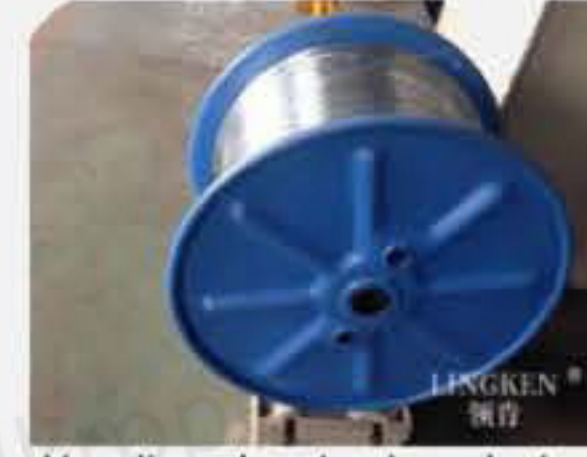
Hot dip galvanized steel wire 热镀锌钢丝