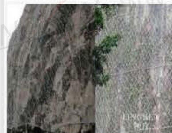
Slope active protection net 边坡主动防护网