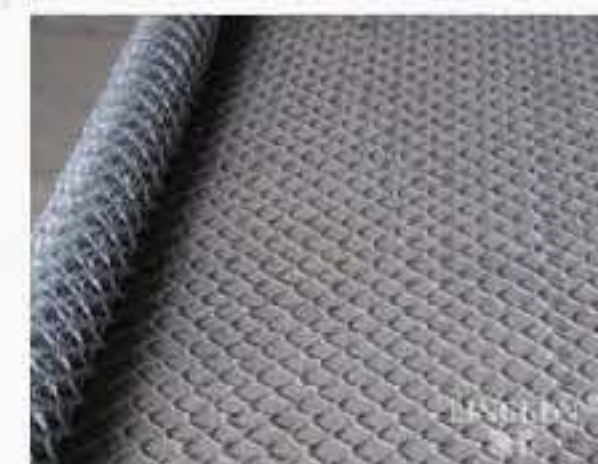
wire rope net 钢丝绳网