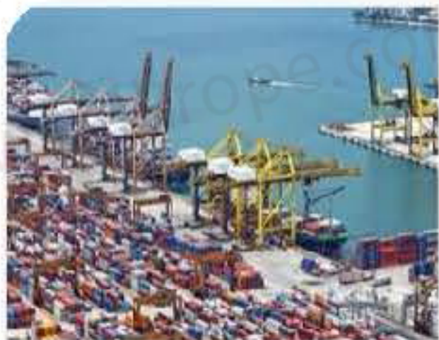
Wire rope for port machinery 港口机械用钢丝绳