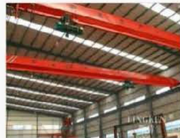
Wire rope for bridge crane 桥式起重机用钢丝绳