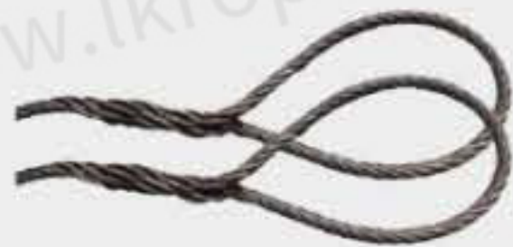
Insert Wire Rope Rigging 插编钢丝绳索具