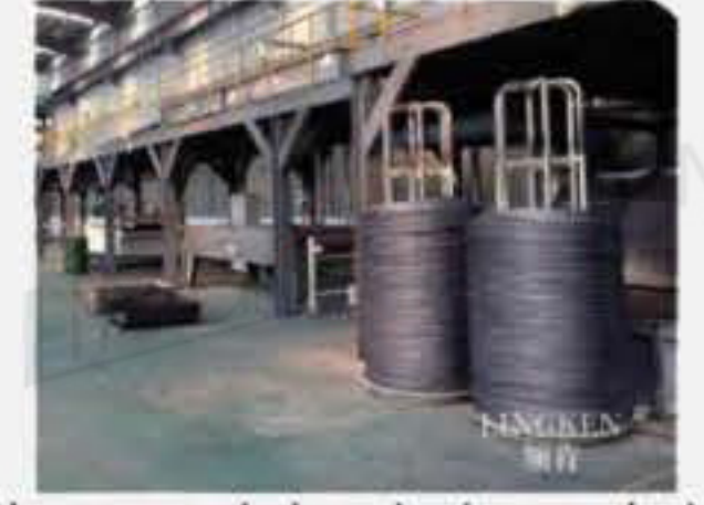
Heat treated phosphating steel wire 热处理磷化钢丝