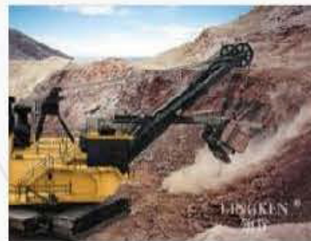
Wire rope for mining machinery 矿山机械用钢丝绳