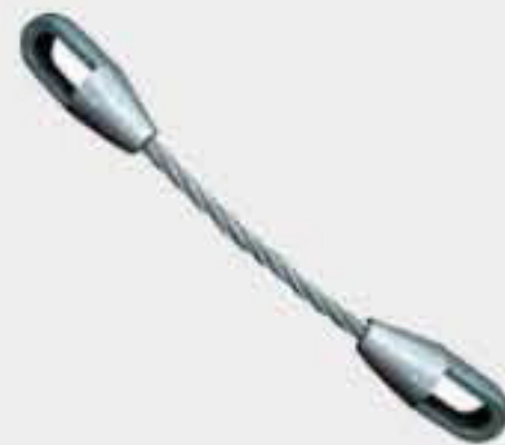
Closed Cast Rigging 闭式浇铸索具