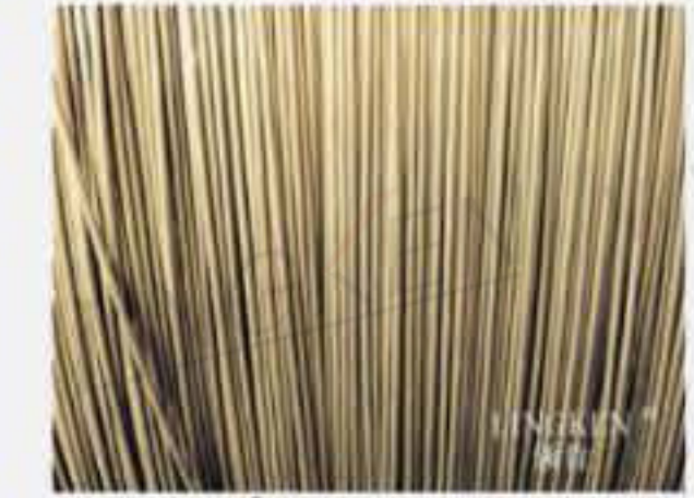
Wire for rope making 制绳用钢丝