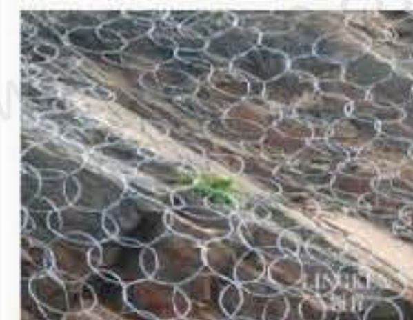
Ring protection net 环形防护网