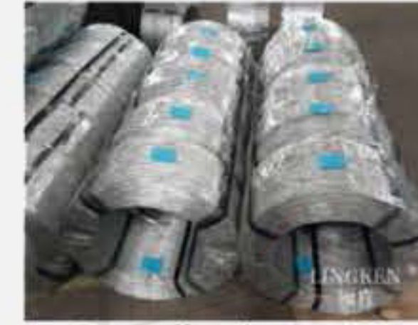
Drop-off packaging(Z2) 脱件式包装(Z2)