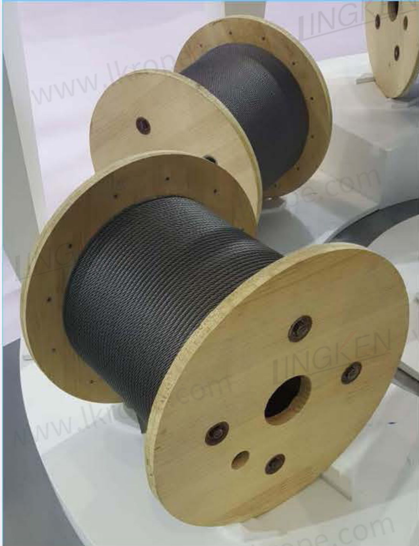
Wooden Reels 木制卷轴