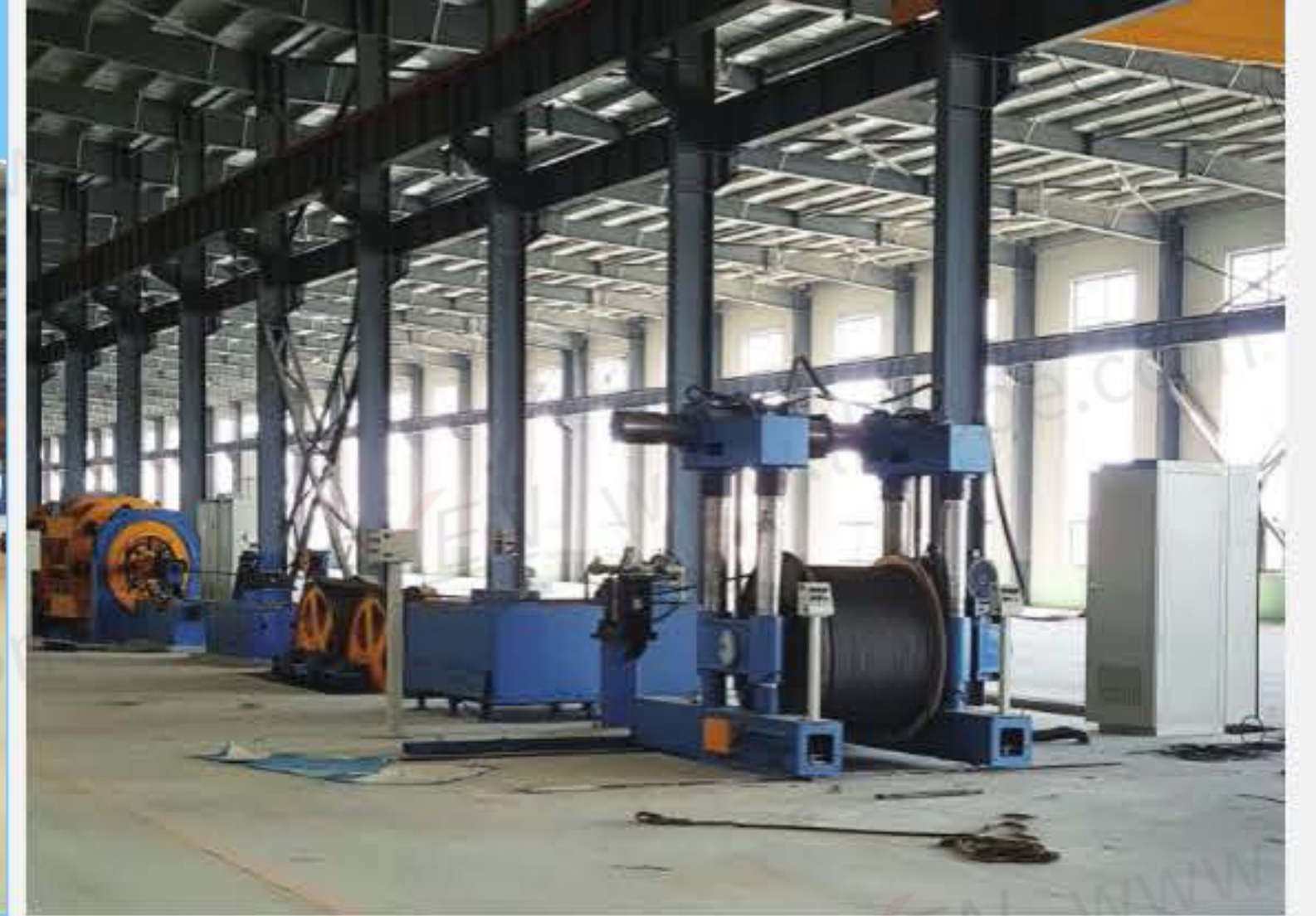
Laying-up Machine 合绳