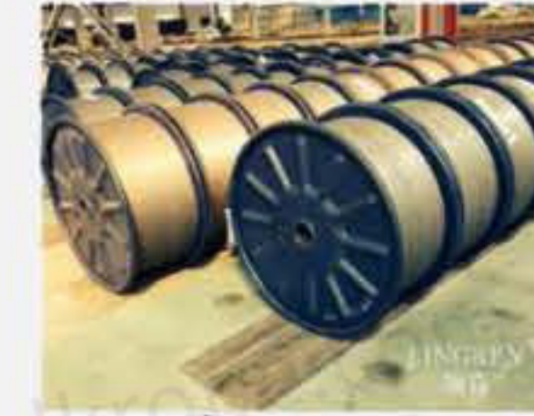
Semi-finished steel wire 半成品钢丝